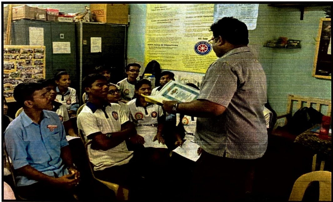
Understating the meaning of terminologies in preamble at NSS room