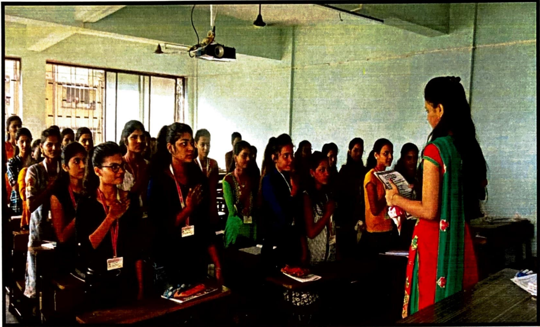
Students Taking Pledge on Indian Constitution Day 26/11/2021