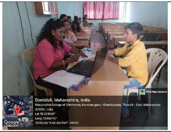
Studetns interacting with the Membars of Silgate solution Ltd and facting the actual interview for Cuspus placement