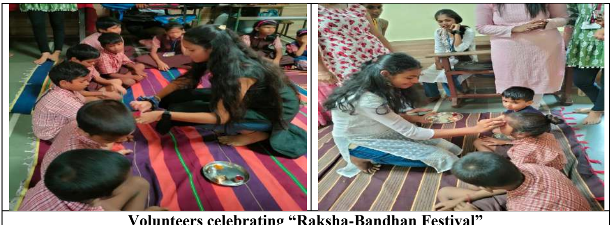
Volunteers celebrating "Raksha-Bandhan Festival"