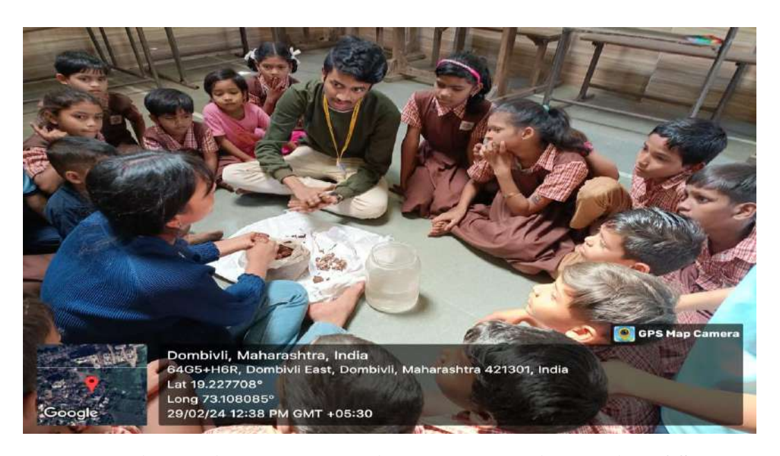
Volunteers creating Environmental consciousness by teaching making of Seed Bolls to school students