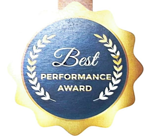
PRINCIPAL MANJUNATHA COLLEGE OF COMMERCE Dombivli (East)