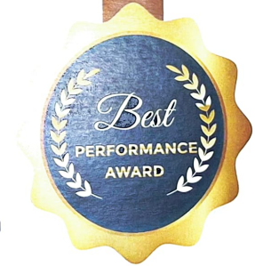
PRINCIPAL MANJUNATHA COLLEGE OF COMMERCE Dombivli (East)