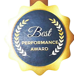
PRINCIPAL MANJUNATHA COLLEGE OF COMMERCE Dombivli (East)