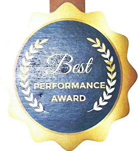
PRINCIPAL MANJUNATHA COLLEGE OF COMMERCE Dombivli (East)