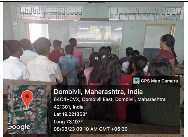
Film Screening for Student on Women issues