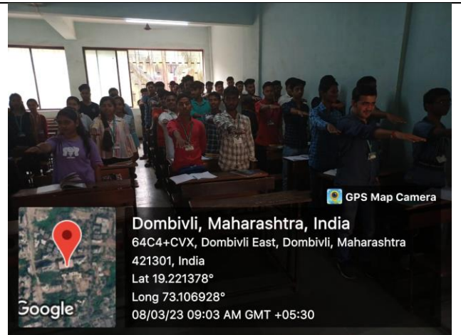
To enhance women's dignity, students has taken oath on womens day.