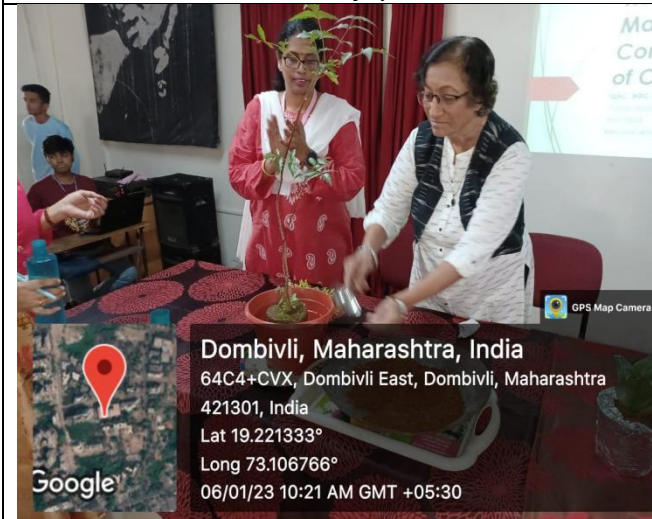
Inauguration by Planting Neem Tree