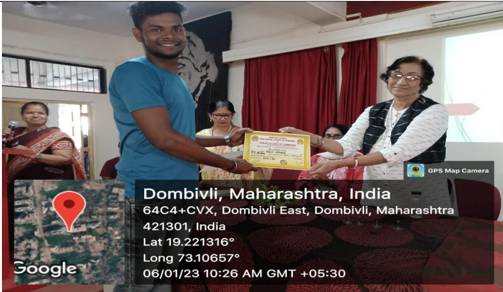
Distribution of Certificate of essay writing Competition held on Savitribai Phule Jayanti 03 January 2023