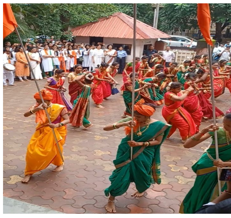
Lezim Performance in a traditional manner