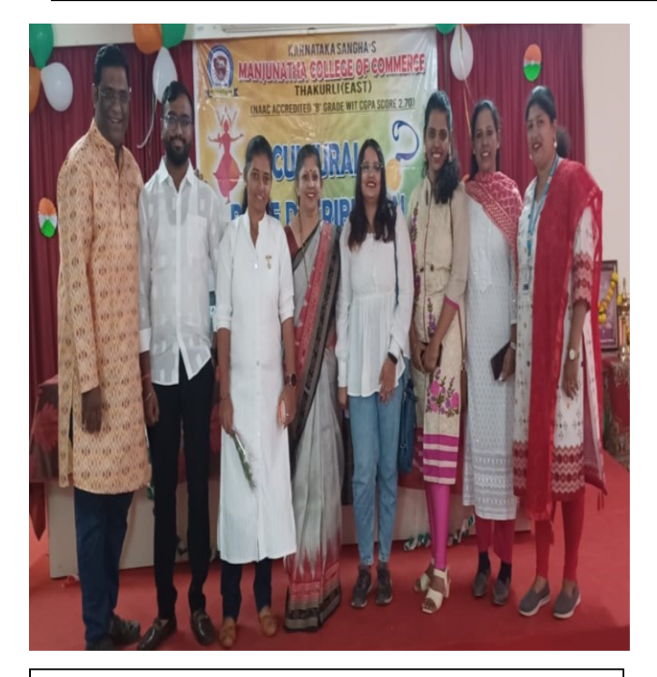
Alumni Attendance during the Republic Day