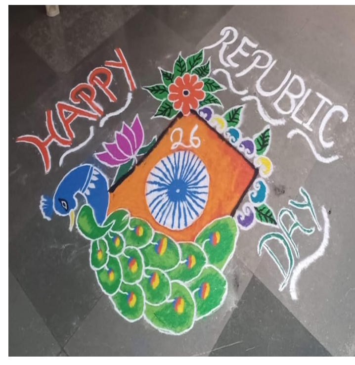
Rangoli Drawing by students to highlight patriotism