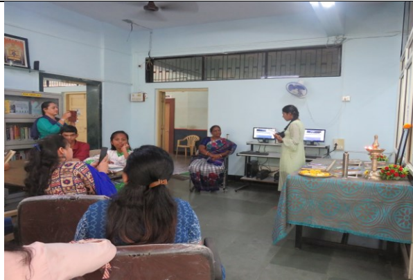
Book review presenters and listeners.