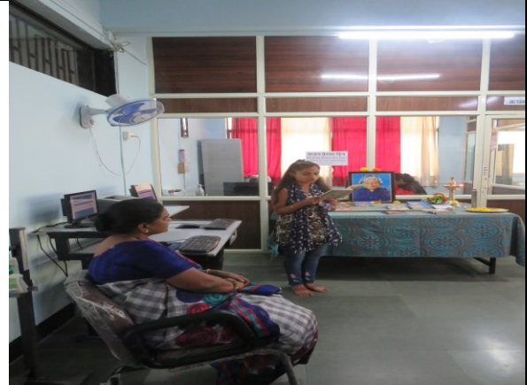
Book Review presentation by student