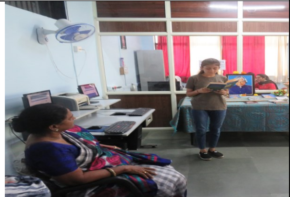
Book Review presentation by student