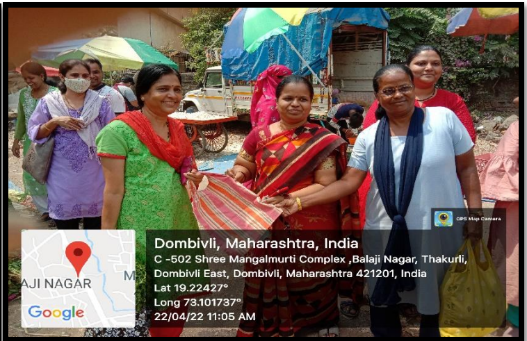
Cloth bags distribution at 90 feet road, Khambalpada, Thakurli along with KDMC officials and Paryavaran Dakshata Mandal