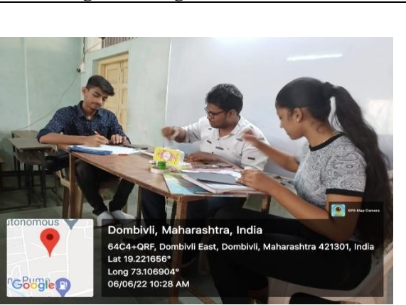
Students participation in Drawing Competition