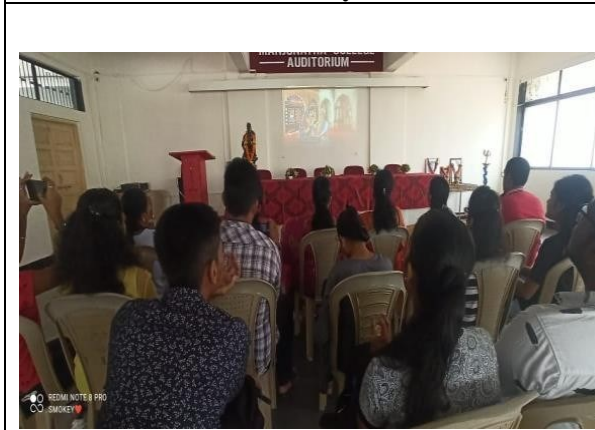
Short Film Screening on Shivaji Maharaj