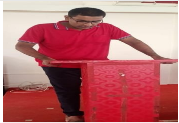
Students participation in Essay reading Competition