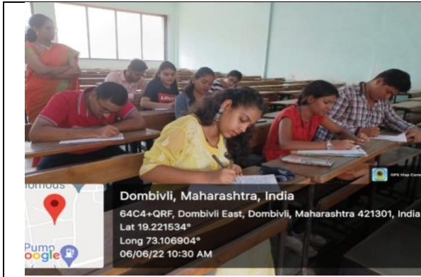
Students participation in Essay writing Competition.